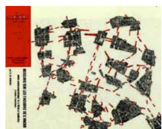
Guide psychogéographique de Paris, Guy Debord 1955

The dérivé invited to experience the city as a playful territory where the concept of circulation means pleasure and adventure rather than functional mobility inside the circuit of the productive structures of the city.