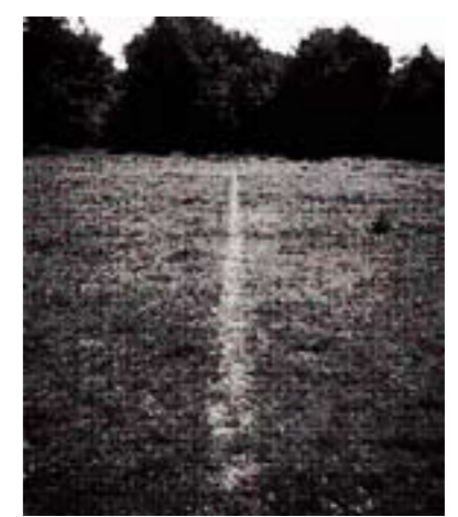
A line made by walking, Richard Long 1967

Voids have the evocative power of absence, hope, expectancy, freedom, space of possible, the utopian, the future... Dérivé becomes the tool for integrating those metropolitan spaces that demand comprehension rather than design; and to be filled with meanings rather than with things.